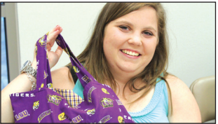
page 2 Letter From Jodi