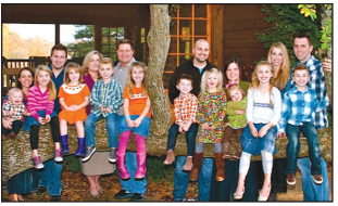
page 3 Volunteer Spotlight

10420 Heart of Hope Way Keithville, LA 71047 318.925.4663 www.heartofhopeministry.org